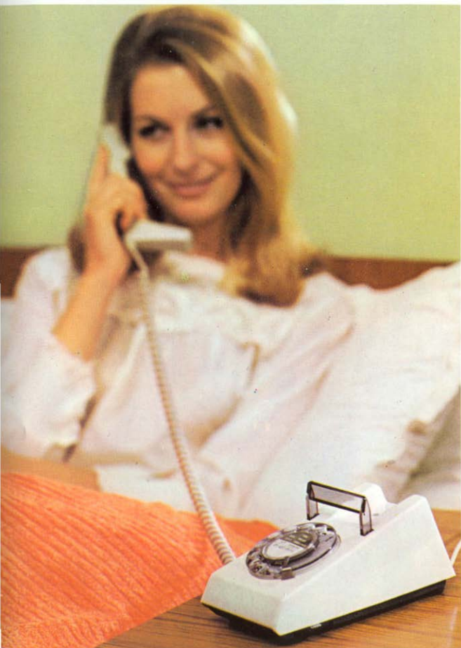
TRIMPHONE - sleek, compact, featherlight. Available in 3 colour variations.