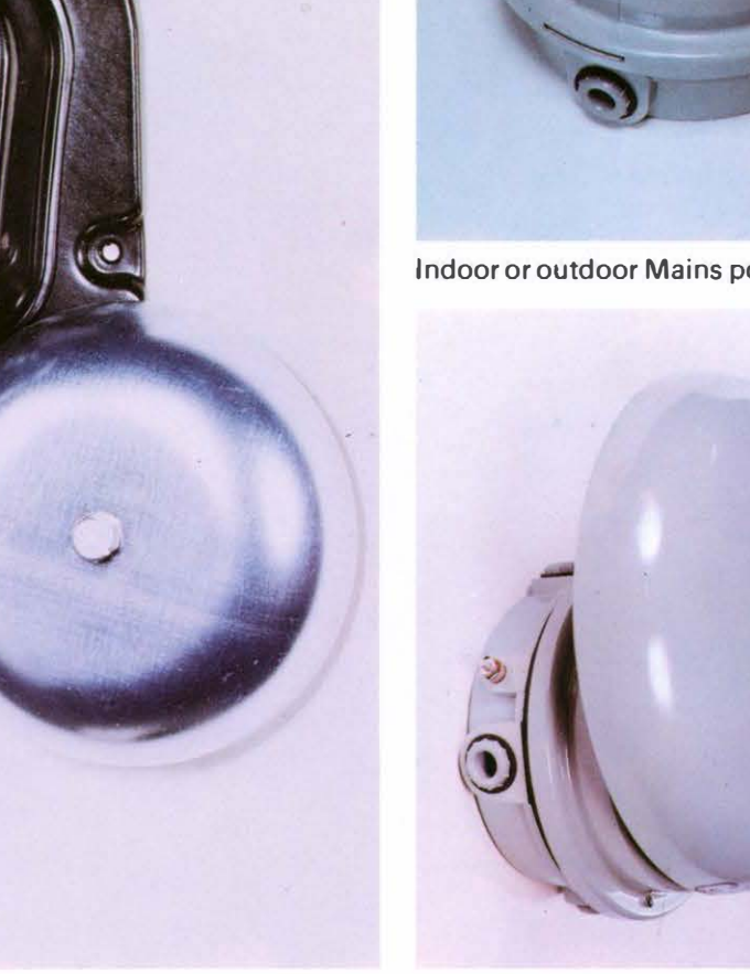
Indoor or outdoor Mains powered 10" gong