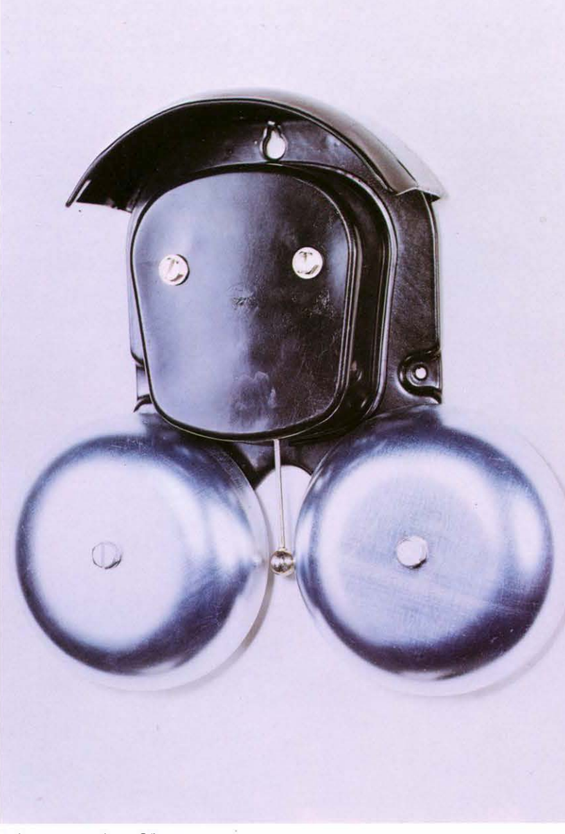
Indoor or outdoor 6" gongs