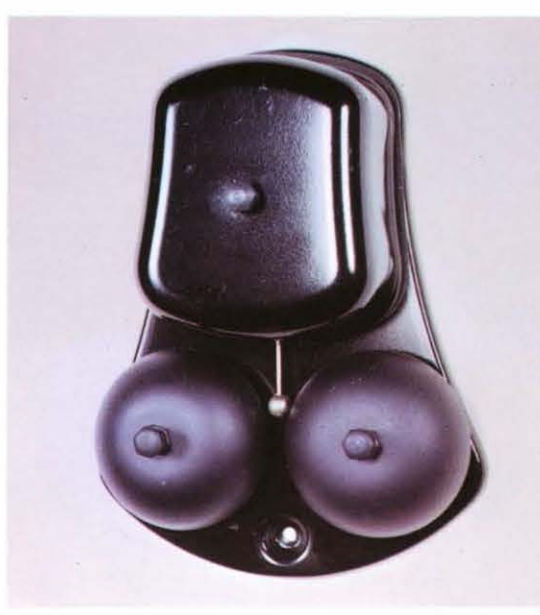
Indoor or outdoor 2<sup>1</sup>/<sub>2</sub> gongs