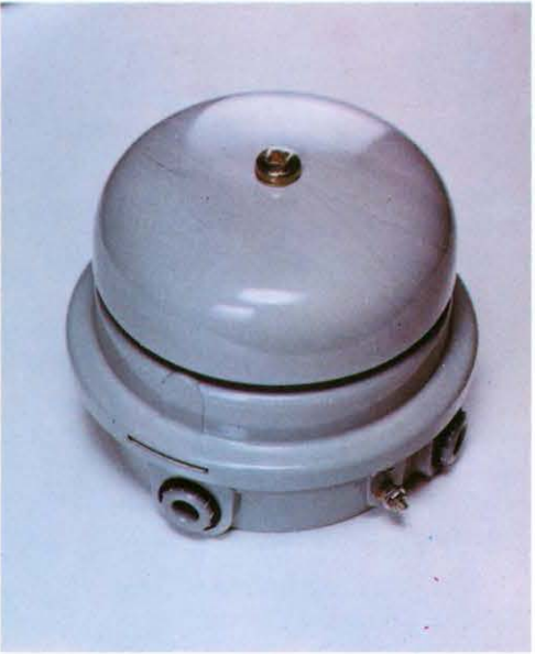
Indoor or outdoor Mains powered 6" gong