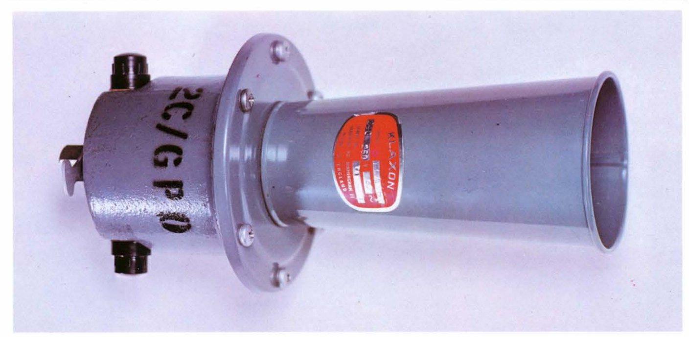
Indoor or outdoor Mains powered 'Hooter'