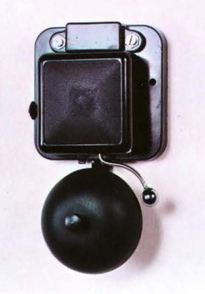
Indoor 21 gong

A mains-powered hooter (see General Information) is an alternative to the bell with the 254mm (10") gong in very noisy conditions, but this is not permitted to sound continuously.