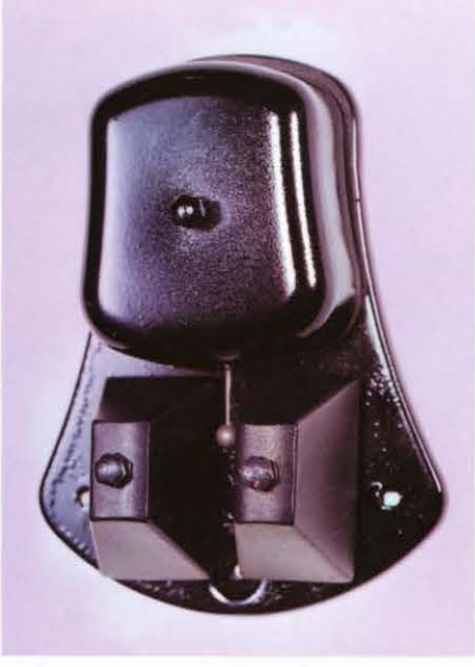
Indoor or out door 'Cow' gongs