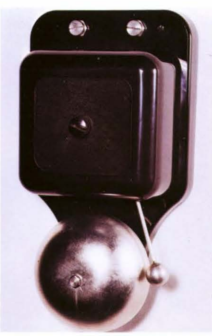
Indoor 4" gong