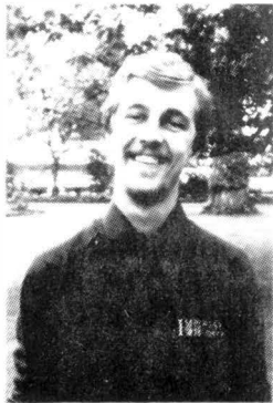
REGINALD BUNTHORNE WILLIAM WHITE