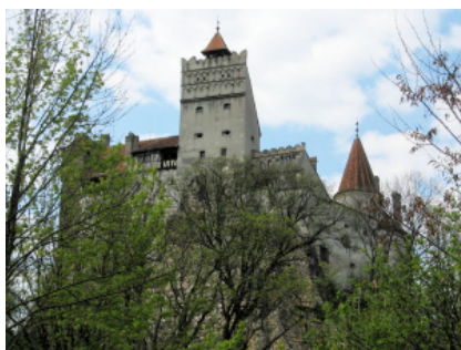
Bran Castle - Associated with the novel Dracula

Romania is a country of contrasts – desperate poverty, ugly concrete buildings from the communist era and 21st century cities.