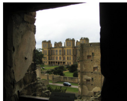
Hardwick Hall seen from the Old Hall

Sadly the famous cascade at Chatsworth was only running for two hours a day and was a rather pathetic trickle, owing to the drought and insufficient water running off the moor to power it.