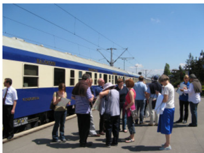
Boarding the Danube Express

We saw people scattering seed from a basket – just as in the New Testament – and medieval strip farming. The houses in the villages were very dilapidated but they all had satellite dishes on the walls.