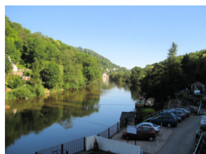
Symonds Yat in evening sunshine