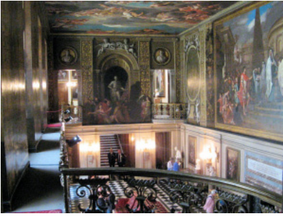
The grand staircase at Chatsworth