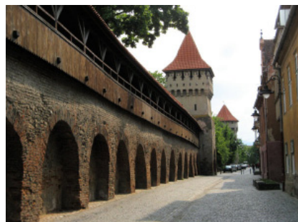
Sibiu, European city of Culture 2007